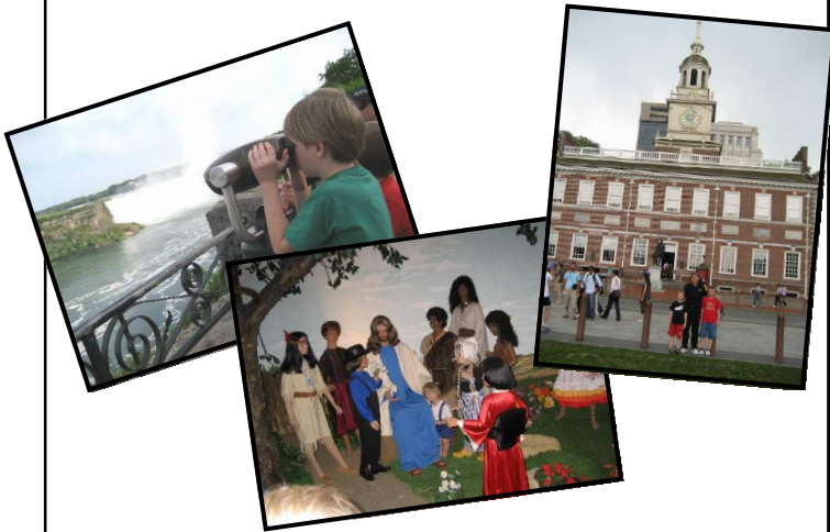
Stops Along the Way to See the Sites

As we traveled the east coast this summer, we also took time to see some of the sites along the way. Niagara Falls and Historic Philadelphia were two of our stops. We also saw a wax museum in Ohio that recounted the life of Christ. These little side trips always give a break to those traveling and give the kids some experiences that they would otherwise miss living overseas.